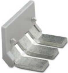
Insertion bridge, pitch: 31 mm, number of positions: 3, color: gray

Please be informed that the data shown in this PDF Document is generated from our Online Catalog. Please find the complete data in the user's documentation. Our General Terms of Use for Downloads are valid ( http://phoenixcontact.com/download )